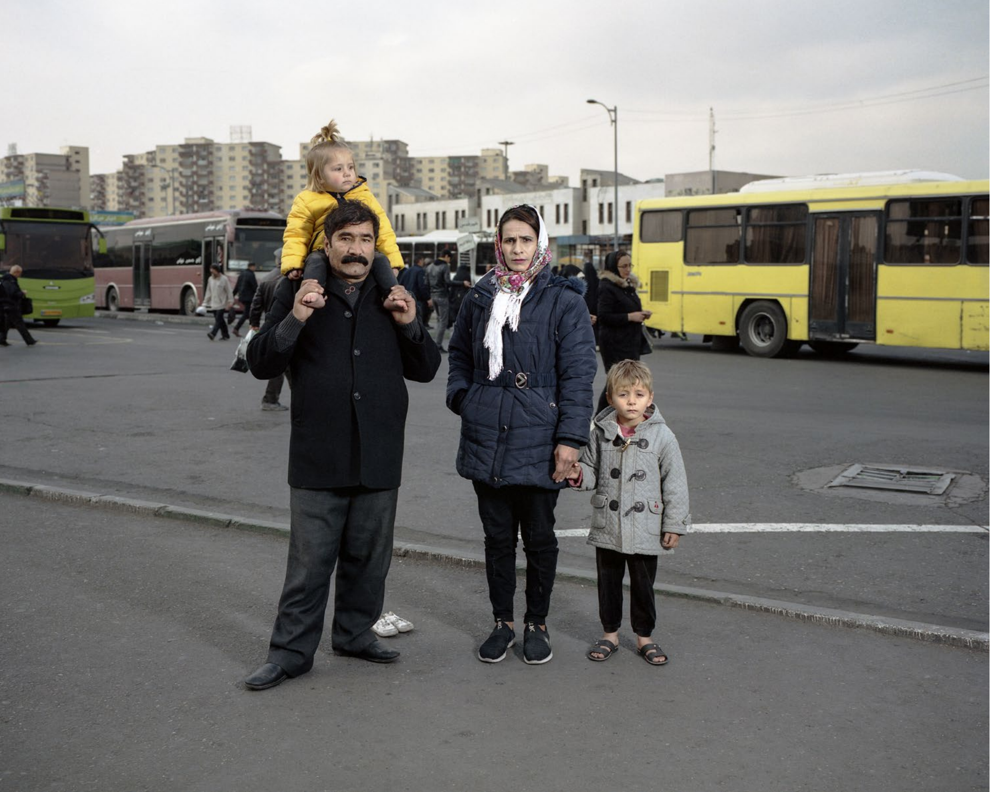
First: Azadi Terminal The terminal is a place where you witness the majority of Iranians migrate from the West of the country to the capital. At the terminal thousands of people migrate to Tehran on a daily basis.